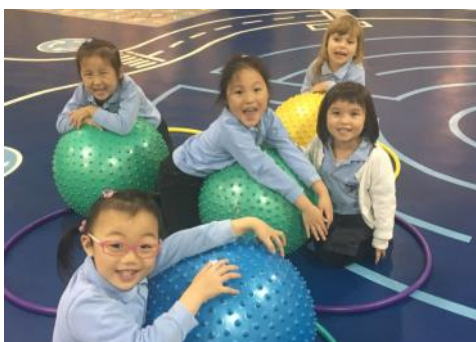
Fun in the indoor playground