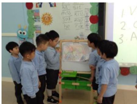
Most definitely a volcano or two erupted