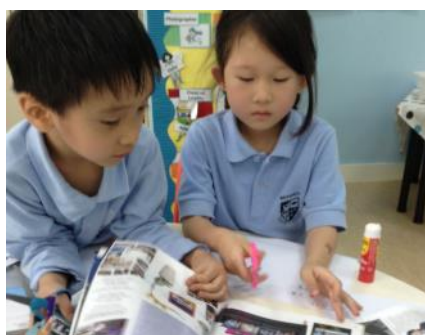
More spelling words