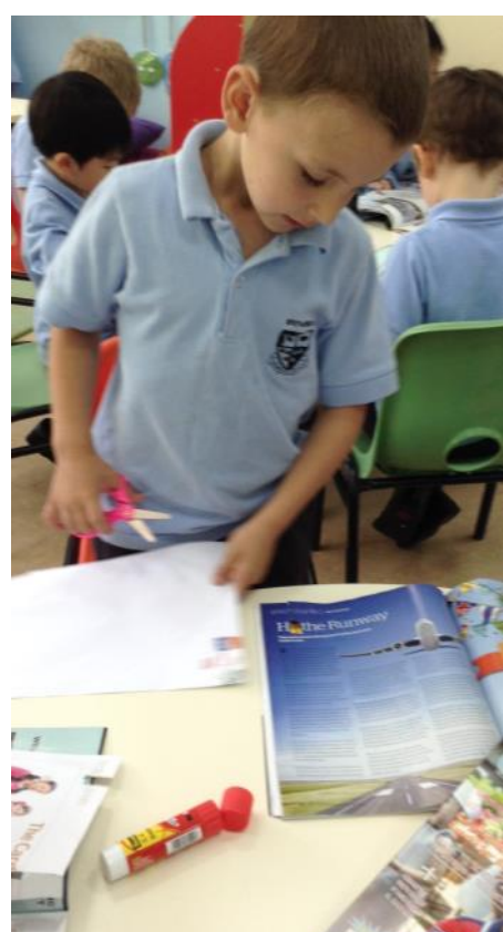
Searching for our spelling words