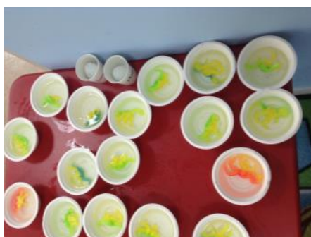
We hatched dinosaurs!

Next week we will begin our new topic, People Helpers and Occupations, starting with a look at what our parents do for a living and who helps us at home.