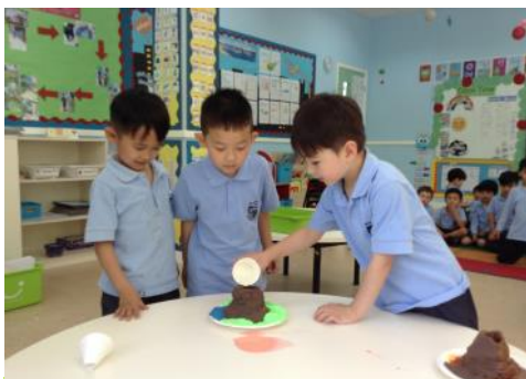
We should add some vinegar!