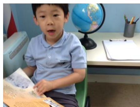
Reading up on animals