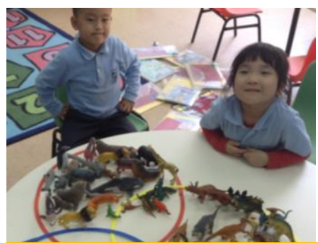
Sorting skills- dinosaurs, animals and trucks