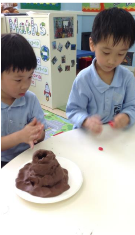
Building a volcano