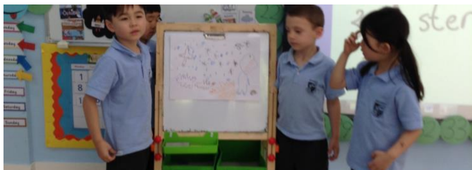
Our theory is climate change