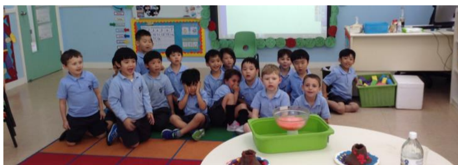
Our science experiment!