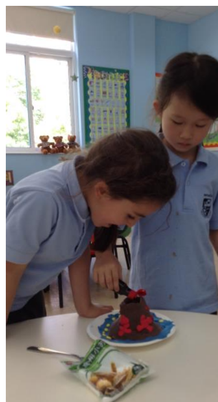
Lets add some red colouring