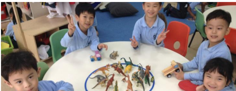
Keeping our dinosaurs safe