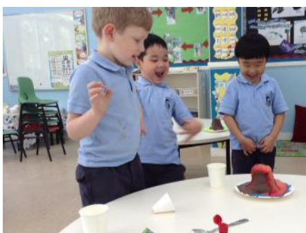
Look it erupted!