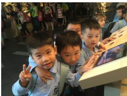
Having fun with friends at the museum