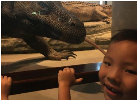
I'm not scared of a Komodo Dragon!