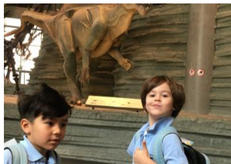
Look what we found!