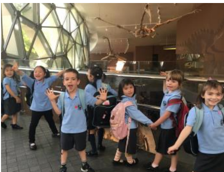
We found the Pterodactyl!