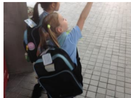
Look...it's a dinosaur!