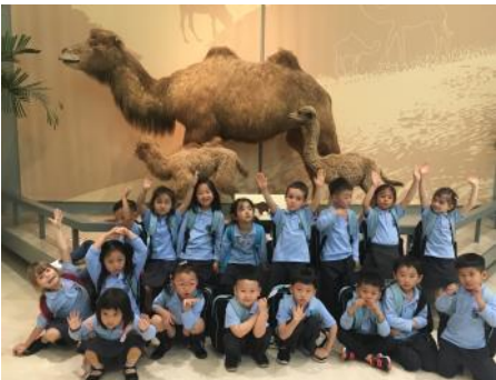
Reception B Boys and Girls Having a Great Time at the Natural History Museum