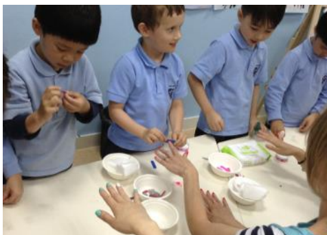
Taking care of mum's nails