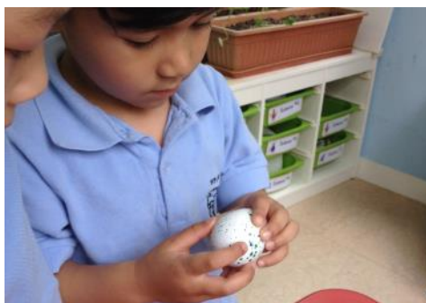
Dinosaur eggs are very strange looking!