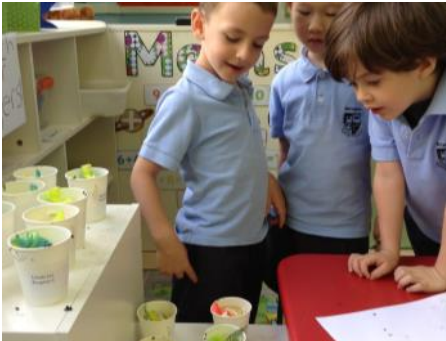
Looks like they ate all of our plants overnight!