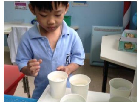
Placing it in the egg daycare!