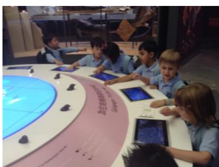
Birds around the world