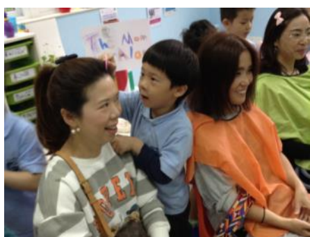
Treating our mums to some hair treatments