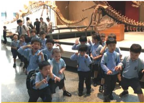
Our dinosaur faces are scarier!